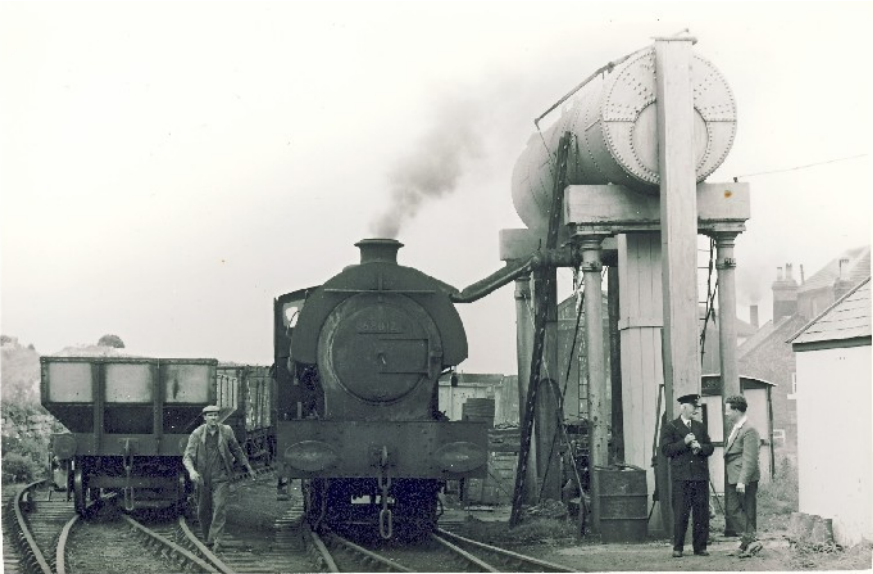
J94 68012 taking water at Middleton Top on the Cromford and High Peak Railway on 27 June 1964. This loco was the last example of the class in BR service, ending its days at Westhouses shed being formally withdrawn in October 1967. WRS C937

Currently there are only about 10 ex-WD built locos working and six former pure industrial versions in traffic, but there are approx. 19 locos being overhauled/restored, including the only two “real” J94’s!