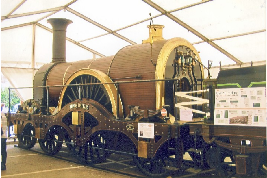
“Austerity” RSH 7135/1944, WD no.75185, seen here in her rebuilt form as the replica Broad Gauge IRON DUKE at the Gloucs-Warks Rly GWR 175 event held during May 2010.

RSH 7135/1944, WD no.75185 was donated to the Science Museum in 1981 after her useful working life at NCB Bickershaw Colliery, Leigh had come to an end, and was sent to Resco (Railways) Ltd, Woolwich for a slight rebuild! Her cylinders, boiler (with dome removed and a new smokebox tubeplate to lengthen the barrel), crank axle and valve gear (re-assembled in the original Gooch configuration) were used to form the basis of the replica broad gauge IRON DUKE for the GWR 150 celebrations held throughout 1985.