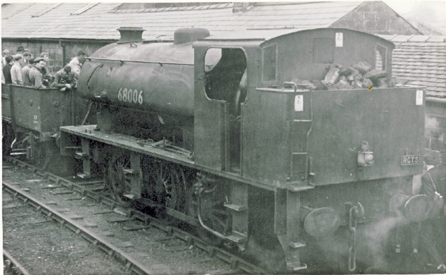
68006 at Sheep Pasture on 27 June 1964. Note oval buffers and rebuilt bunker.

During BR ownership, the 'J94's field of operation was spread further. In basic terms the allocations could be broken down thus; - 45 on the North Eastern region, 23 on the Eastern region and 7 on the London Midland region. The LMR locos were employed on the notoriously steep Cromford & High Peak Railway in Derbyshire, with its formidable 1:14 Hopton Incline. Three locos arrived during 1956, one working between Cromford and High Peak Junction at the bottom of the line, whilst the other two were employed at Middleton Top.