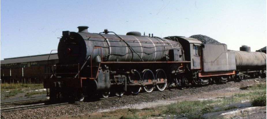
South Witbank Colliery and Class 15CB 4-8-2 (Baldwin 1925) ex SAR No 2066 the last locomotive on the January 1976 list of 1,918 of SAR locomotives to be "copped".

Totally unexpected there she was in quite clean condition. I was elated, the last SAR locomotive I had hoped to see was now "in the bag". But after the elation, the sadness, in the yard adjacent to the shed locomotives were being cut up. That spectacle set the scene for the remainder of my SA jaunt, at each shed I visited locos were dumped and rusting away or being cut up. Setting off around the country I intended to visit areas where steam still held sway. In the main this was now industrial concerns or SAR branch lines.