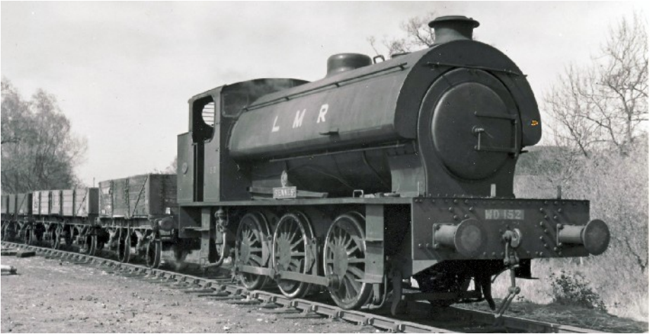
“Standard” Austerity WD no.152 RENNES seen at Marchwood, 25 th April 1955. Built by RSH 7139/1944 as WD no.75189, she is currently being restored to working order and will re-appear in this guise.