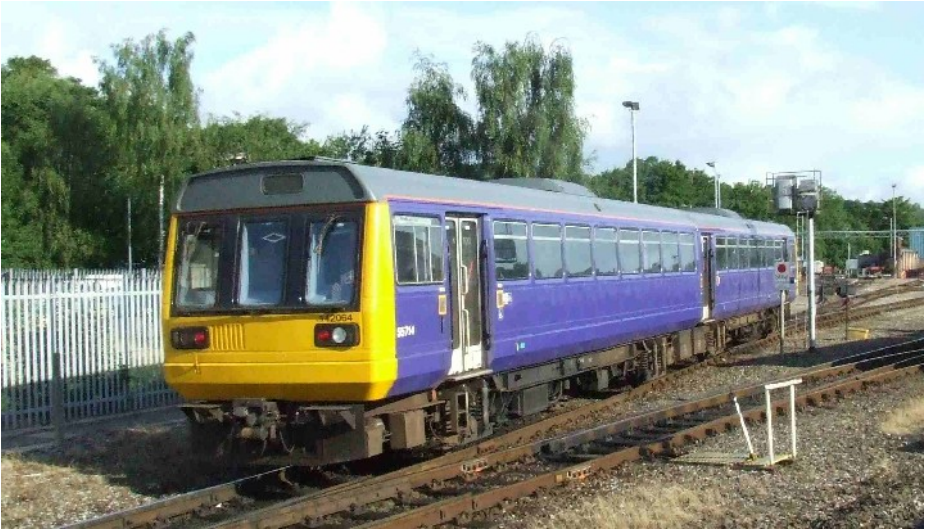
Pacer 142064 has recently visited Newton Heath for a repaint in base blue ready for transfer to Northern Rail. It is seen here shunting from the maintenance shed to the parking roads at Exeter on 29 June 2011. KA