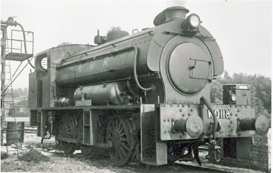
WD War Standard Specification rebuild, WD no.118 BRUSSELS at Longmoor. Built by HC 1782/1945 as WD no.71505, rebuilt by HE May 1958. The Westinghouse pump was fitted on the footplate above the r/h front footstep; note the “patch” and lines of bolt-heads where the saddle tank was cut-away.

In May 1958, Hunslet rebuilt one of the withdrawn Longmoor Military Railway engines to the WD's War Standard Specification. The chosen loco was HC 1782/3-1945, WD no. 71505 - 118 BRUSSELS which then took up her role as a training loco back at Longmoor. The rebuild included conversion to oil firing and the fitting of Westinghouse air brakes, extra safety footsteps for shunters and a steam turbo for the large electric headlamps, front and rear. She was later sold to the K&WVR in September 1971 where she remains, currently as a static exhibit inside Oxenhope museum.