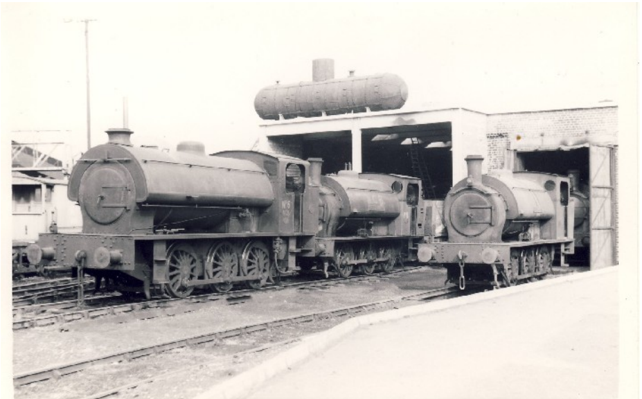
Seen here at Littleton Colliery are Austerity locomotive number 6 and two further members of the fleet, numbers 8 and 1. This picture taken on 25 March 1961 is part of the WRS archive. See article by Steve Green from page 5.