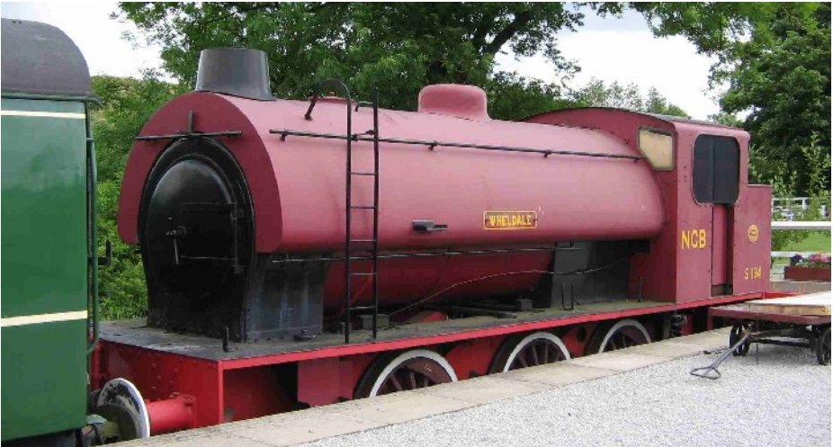
S134 at Emsay awaiting restoration on 20 July 2005.

The final workings took place on 24 th September 1982 when HE 3168/5-1944, WD nos. 75118 - 134, NCB no. S134 finished her last shift at Wheldale Colliery, Castleford. She can now be found at the Emsay & Bolton Abbey Steam Railway, appropriately named WHELDALE.