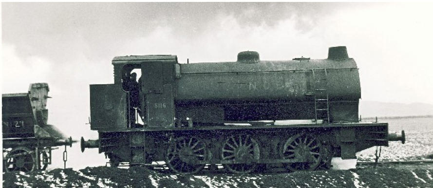
Stoker fitted National Coal Board S116 at work at Water Haigh Colliery in the Castleford coalfield, on 27 February 1969. Later transferred to Primrose Hill, S116 was withdrawn and stripped for spares, being taken to Allerton Bywater workshops on 24 March 1971 and scrapped on site by Arnott Young and Co in October 1973.

With the implementation of the Clean Air Act 1956, Hunslet set about overcoming the problem of locomotive smoke by purchasing 15 redundant WD locos and rebuilding them between 1961-65, issuing them with new Works Nos. in the process. 11 were fitted with the Hunslet underfeed stoker and Gas Producer System, the visual give-away being the distinctive/ugly chimney and lack of black smoke when being worked hard! 13 locos were eventually sold to the NCB, one was sold direct into preservation whilst the final one remained un-sold and was later scrapped by Hunslet themselves, in 1970.