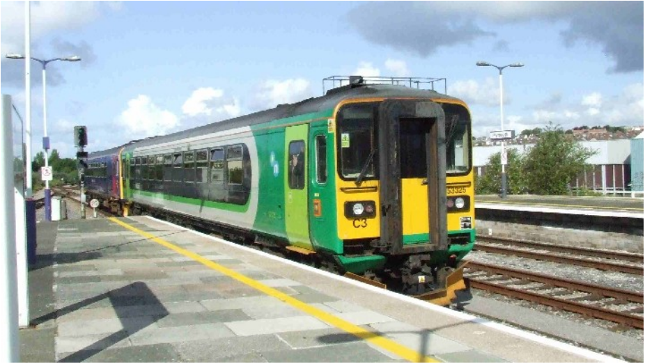
London Midland liveried 153325 seen here at Plymouth on 29 June 2011 coupled to First Great Western liveried 155318 is one of two members of the class on loan to the latter operator pending the arrival of further class 150's. Ken Aveyard