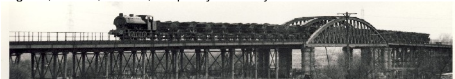
Hunslet 2879 Diana on the main line between Wheldale and Allerton Bywater on 9 April 1971.

And there you have it, a brief account of one of this country’s greatest unsung engines, no frills, no fuss, but plenty of history.