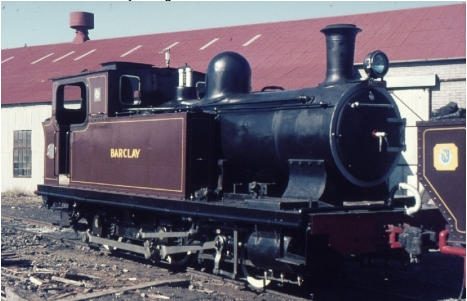
A locomotive which may be repatriated to the UK is this 1907 built Barclay 2-4-0T Ex Jersey Railway No 5 "La Moye" seen at Rosherville Power Station, Johannesburg in 1974.

After all, South Africa was a home from home .... but with sunshine most of the time ! South Africans drive on the left. On Sundays nearly all restaurants and hotels served Roast Beef, Yorkshire pudding and all the trimmings. English was widely spoken. Breakfasts were always "A Full English". As we drove along we tuned in to the local radio stations where we could listen to BBC programmes such as "Round the Horne" and "Just a Minute" .. What more could you ask for ? All of the events described in the five parts of "The Great Locomotive Chase" took place over a quarter of a century ago, just where have all those years gone ?