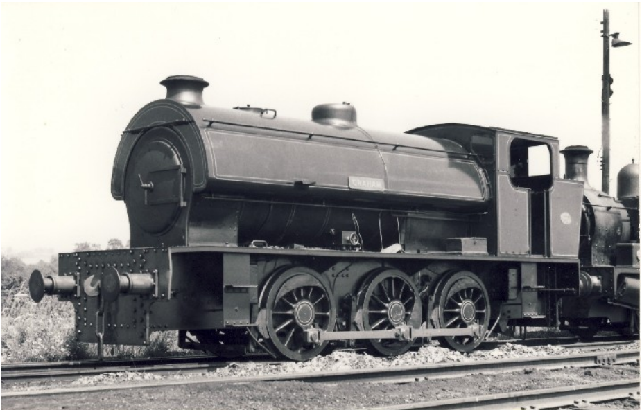
Part of the Austerity family is this small wheeled Hunslet number 2415 of 1941 operated by the Oxford Ironstone Company, and named Graham. See part two of the Austerities from page 5.