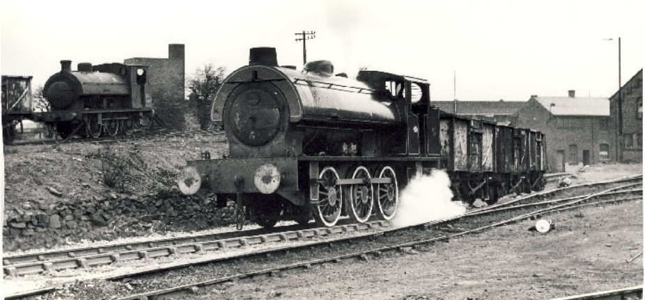
Hunslet 2879 of 1943 and named Diana seen in operation at Wheldale Colliery on 9 April 1971. This loco is preserved at the Caledonian Railway awaiting restoration.

With the preservation movement well underway by this time, not surprisingly a few (under-statement of the year!?) found new homes and a more relaxing lifestyle. Not always loved by enthusiasts, it cannot be under-estimated the amount of work these locos put in, in the early years of many of today's major preserved, sorry, heritage railways, until they simply out-grew them. Fortunately most of the smaller/light and specialist industrial railways can still find plenty of uses for them, in a good way!