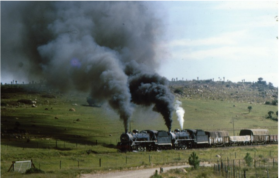
Two SAR Class 19D 4-8-2's No 2735 (RSH 1945) and 3330 (NBL 1948) blacken the sky as they hammer uphill on the Alicedale to Grahamstown line in 1985

As mentioned above, Randfontein Estates Gold Mine were using GMA Beyer-Garratts and I filmed these in action on my last full day in SA before moving on to make my final SAR depot visit. This was at Millsite on the outskirts of Johannesburg where the final number to go into my note book was 3079, this was a Class 15F 4-8-2 built in Glasgow by North British Locomotive Company in 1948. Having photographed it I walked out of the depot and that was it, the last chapter of my ten tours of South Africa. I left South Africa in the knowledge I would probably not return.