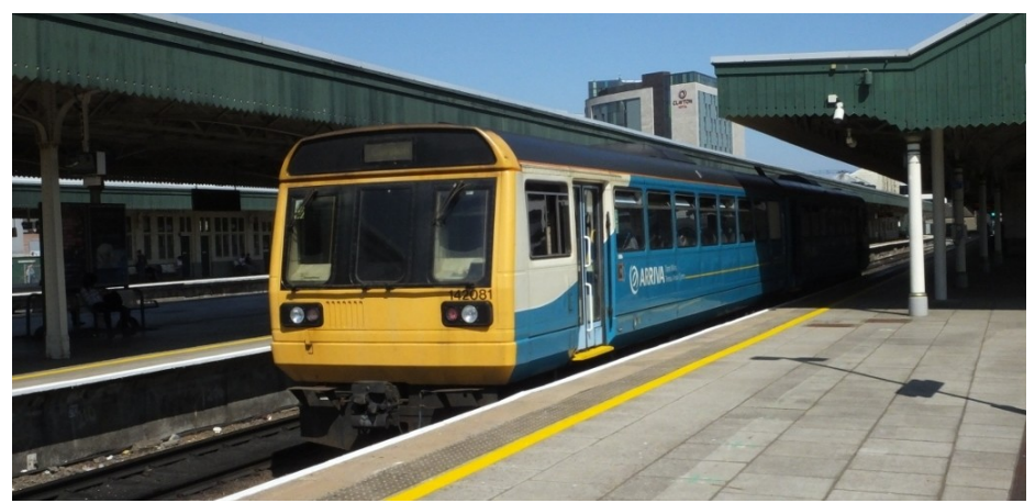
Arriva Trains Wales Class 142 Pacer 142081 at Cardiff 24 May 2017.