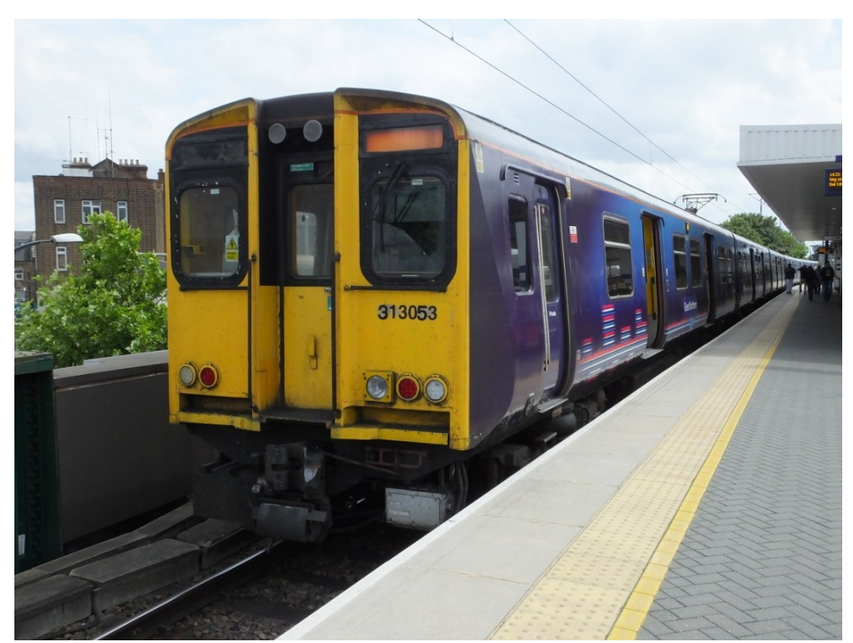
313053 at Finsbury Park on a Moorgate service on 5 June 2017. Ken A