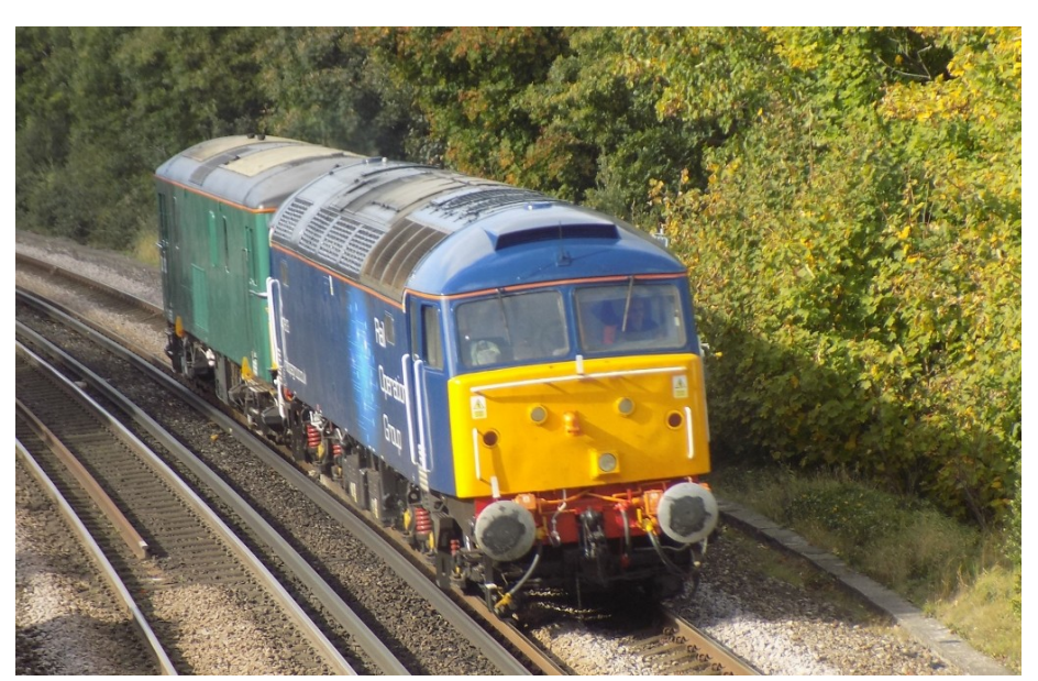
Monday 2nd October 2017 and Rail Operations Group No 47813 towed Class 73 No 73133 away from Branksome. See Railways Roundabout on the following pages.

All in all, a very successful year! Seasons greeting to one and all!