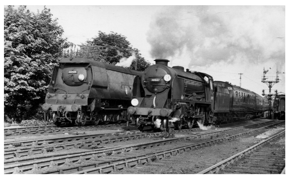
Schools class 30907 departs with the 1705 Bournemouth West to Waterloo with 34009 stood alongside. September 1959. Alan Trickett