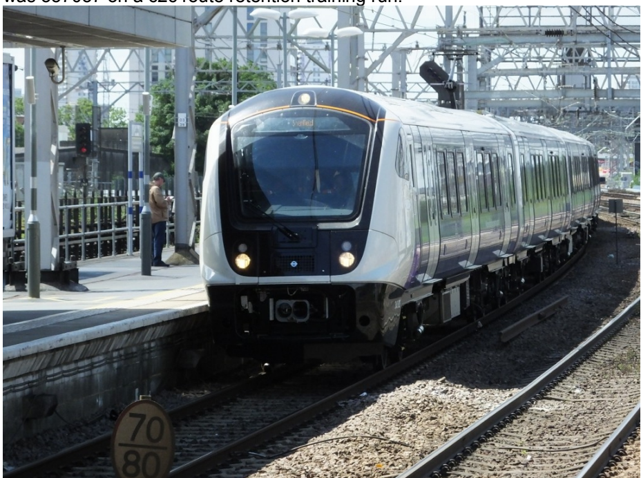
Crossrail unit 345005 at Stratford on a training run on 7 June 2017. KA

We then took a walk down Plough Road which takes you to the rear of the sidings, and were able to confirm it was 707008 on the rear of 707007 that we could see from the station. Back to the station and with newly purchased travelcards we made our way via the Overground to Canada Water, and the Jubilee Line to Stratford. Here we changed to the TFL rail service towards Shenfield, but not before seeing 66001 on freight and 90005 on a Norwich service passing through. Passing Ilford we saw 08700 and 08573 and as we approached Gidea Park we could see 345007 in the sidings. After alighting at Harold Wood we were taken by surprise when 345005 sped through on the fast lines heading for London. Retracing our steps to Stratford we hung about for the return of the 345 from Liverpool Street observing 90004 66501 90002 66504 90013 and 90008 as we waited. Also making a suprise appearance was 357037 on a c2c route retention training run.