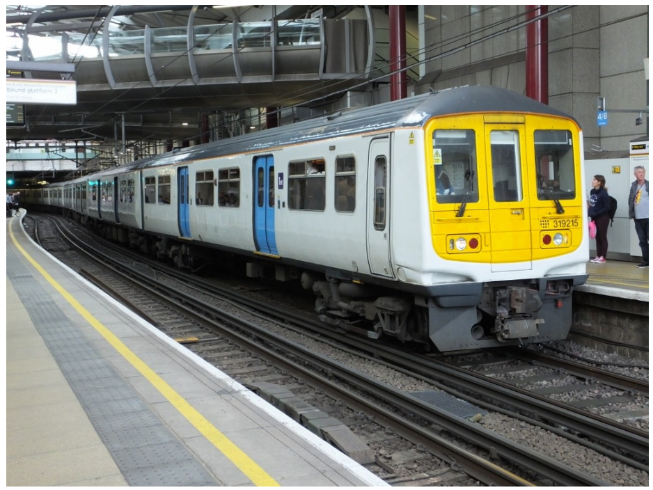
Soon to be redundant Thameslink 319215 is seen at Farringdon on 7 June 2017 whilst operating a service from Sutton.

As always, the sidings around Cricklewood contained a fair selection of class 700 units, some still yet to enter service, with six cops including the unit we travelled on. Back at Farringdon for 1530 we spent the next three hours copping new Thameslink units whilst observing the last remnants of the 319 units which after a lifetime working in the area are now deemed acceptable to be called "new" trains with Northern Rail.