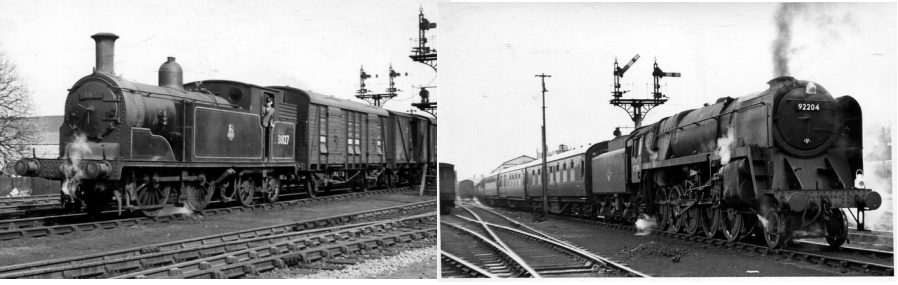
30127 Bournemouth West vans to shed (undated) and 92204 with a Bournemouth West to Bath test train 29 March 1960. Alan Trickett