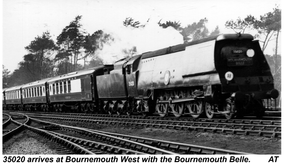
35020 arrives at Bournemouth West with the Bournemouth Belle.