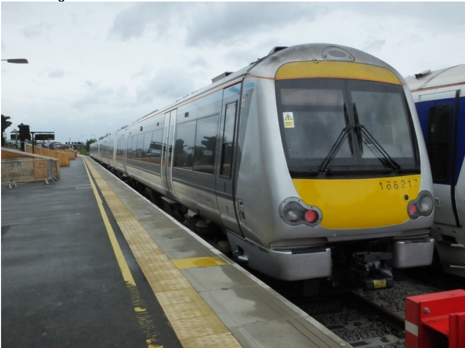
168217 in the Chiltern bays at Oxford on 6 June 2017 with signs of the now delayed electrification visible on the platform. Ken Aveyard

As we approached Bicester we looked forward to the few hundred yards of new railway that links the Birmingham main line to the Oxford to Bicester line and which in turn extends eastwards to Calvert for the reversal in to the land fill site, and previously along through Verney Junction to Bletchley. This link is part of the planned for Oxford to Cambridge East-West rail project but currently has no passenger service beyond Bicester, where this new link has allowed Chiltern to take over the previous Great Western operated shuttle service. What was noticeable on the run in to Bicester Shopping Village station, the on board announcements were made in Mandarin (or one of the other Chinese dialects) and prompted the mass exodus of passengers from our carriage.