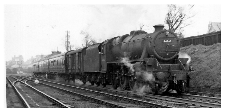
44963 leaving Bournemouth West on the 3.40pm to Bath. Alan Trickett