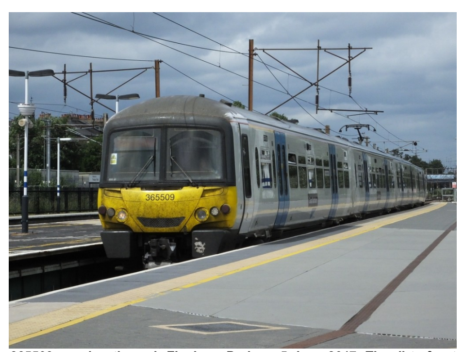
365509 passing through Finsbury Park on 5 June 2017. The dirty front end as a result of previously being in the middle of a rake. Ken Aveyard