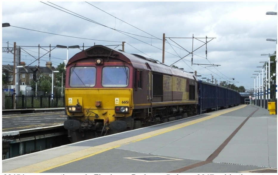
66151 passes through Finsbury Park on 5 June 2017 with the return spoil empties from Barrington Quarry to Wembley. Ken Aveyard