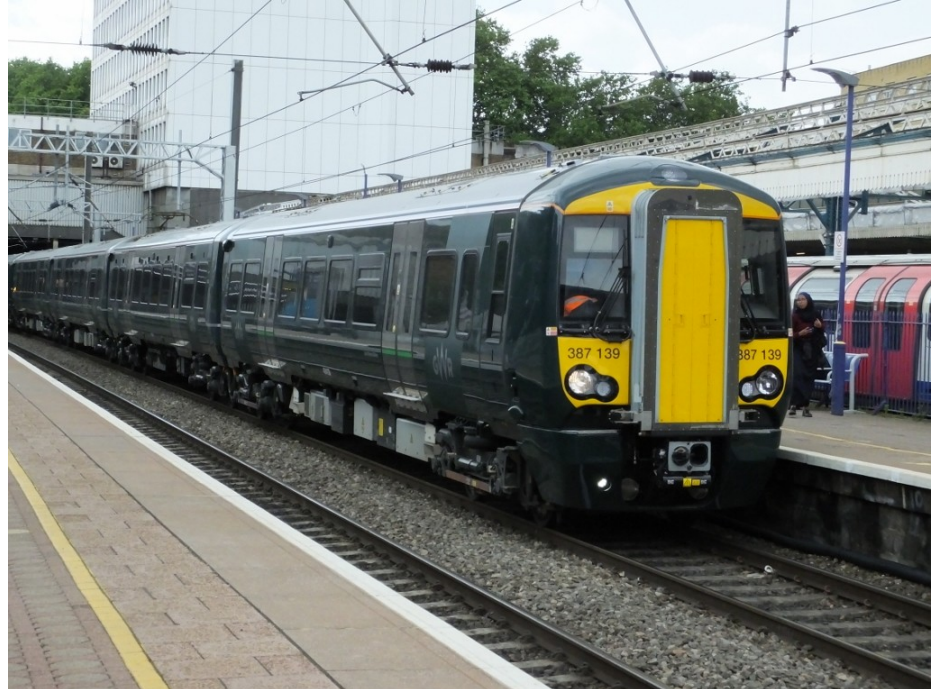
387139 passes Ealing Broadway on 6 June 2017.