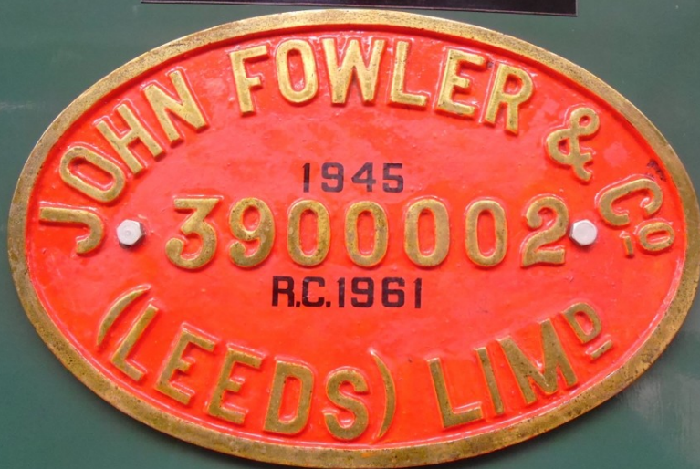
Worksplate of our cover picture at the Middleton Railway. Ken Aveyard