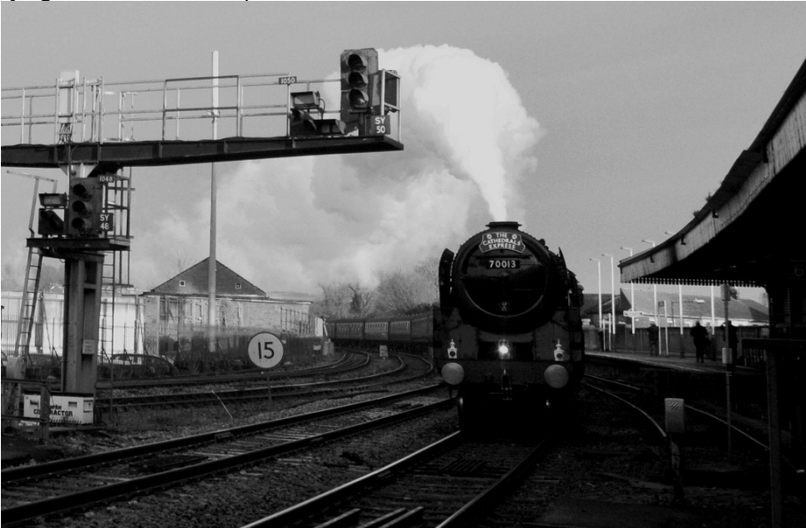
BR 7MT class 4-6-2 Britannia Pacific 70013 Oliver Cromwell at Salisbury on 19.12.2017.

First that feint drumming sound, then smoke billowed above the far buildings into the sky. A magnificent machine came into sight around the long approach curves, working so hard up the hill towards the station, hissing and snorting, trying its best to make up lost time.