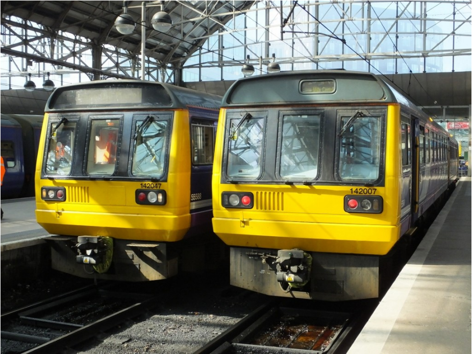
Northern Rail liveried class 142 Pacer units 142047 and 142007 sit side by side at Manchester Piccadilly on 27 March 2017.