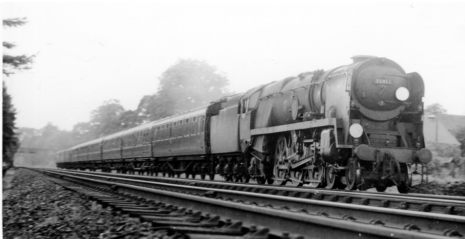
35012 passing Farnborough on an up express 8 June 1964 WRS C908

Before I left home, I always liked to write up in my 'rough' book all the distances and timing points I hoped to find on the way; it was also helpful to know when on the train how far away the next timing point would be when one was concentrating on finding the \frac{1}{4} mileposts to calculate the speed of the train using the stopwatch.