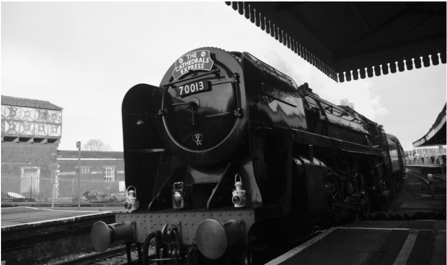
Britannia Pacific 70013 Oliver Cromwell heads the delayed Cathedrals Express past the old water tank at Salisbury having earlier waited over an hour for its own water supply at Overton. 19.12.2017.

Like a cinema film that had stopped and started again, all the characters in the piece start doing again what they were doing just before this steaming giant burst on the scene.