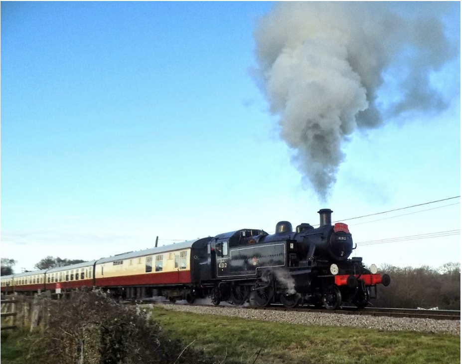
Ivatt 2 No 41312 in charge of the “Wessex Belle” dining train, on 3rd December 2017.

Class U No 31806 was the engine used to haul the final SR service trains for 2017 on December 31st and the first passenger trains for 2018 on January 1st. On January 10th Battle of Britain No 34053 “Sir Keith Park” returned to Dorset from its period of hire to the Severn Valley Railway, it was taken straight to Herston Works for attention after which it should enter service later in the year. The railway then entered a period of no trains running when minor permanent way and signalling works were carried out.