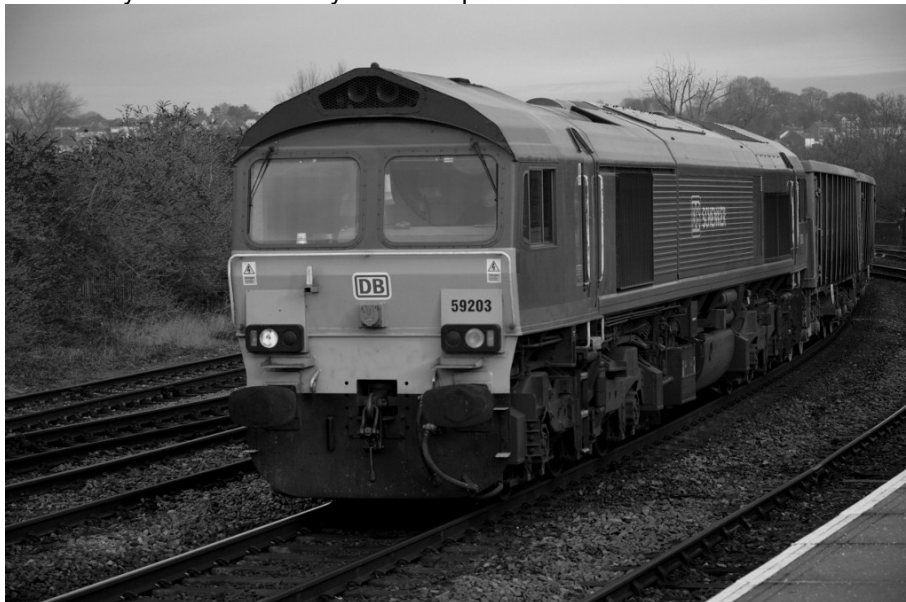
Class 59 203 hauling freight wagons through Salisbury on 19.12.2017.

Fortunately Salisbury is an interesting place to pause and the café's staff quite accommodating. Whilst waiting we watched a track gang tighten a lot of nuts along the rails and help repair a sticking point too. I also managed to see my first spanking new South Western Railway livery up close too. It was on a local Class 158 unit I'd first seen in Brighton many years ago. Now in dark blue and grey it looked very smart indeed. The guard was a friendly chap who wanted to know the latest on the Steam Special timings. He was hoping to see it on his return journey. But still we had no news of its whereabouts when after twenty minutes he sadly had to depart his train back.