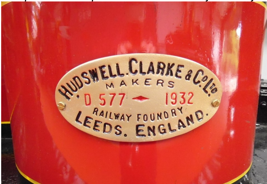
Worksplate of the rear cover picture of Mary at Middleton Railway. KA