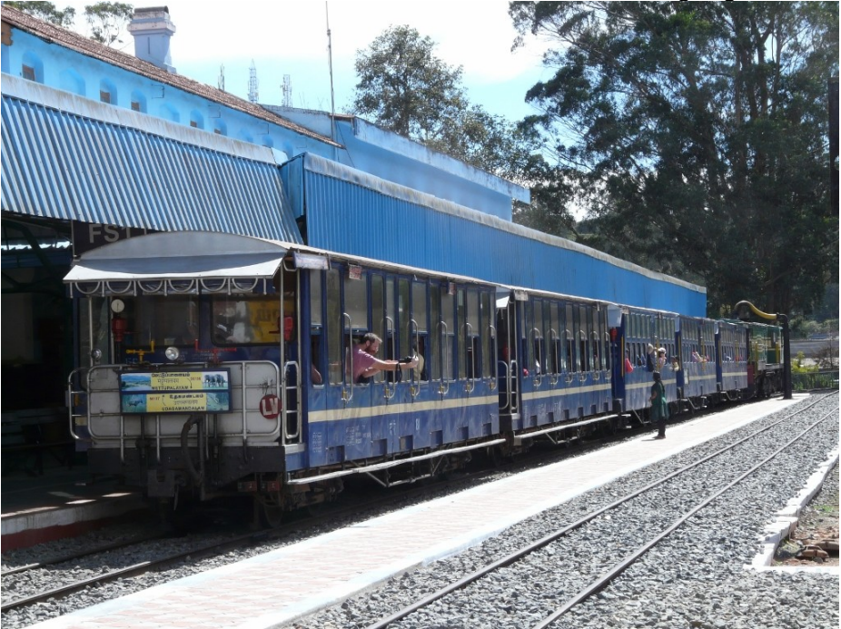
Train at Ooty station ready to form the early afternoon departure for Coonoor. Peter Watson

We were booked on the afternoon train to Coonoor where our driver would meet us so we duly set off from the hotel and walked down through the town to the railway station on the metre gauge line that runs in from Mettupalayam on the plains. The line runs for a total distance of 46km and has a maximum gradient of 1:12 on the Abt rack section. Work began in 1886 and was completed to Coonoor in 1899 and then the extension to Ooty followed with the first trains running in 1908. I had no idea what to expect – lack of homework beginning to show up here – but was reasonably happy to see a YDM-4 Class diesel run in with 5 coaches. This was an adventure, we were in India, we were on our own and we had no idea where we were going.