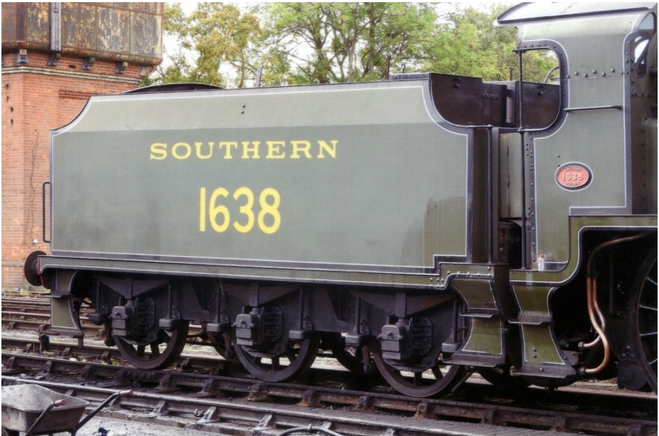
Tender no.734 in real life, now with the spoked wheels.

For use with 'S15' 30830. Tank and plough removed. Loco and tender chassis sold by the MLS to the NYMR, to fund the purchase of STOWE, where they await restoration.