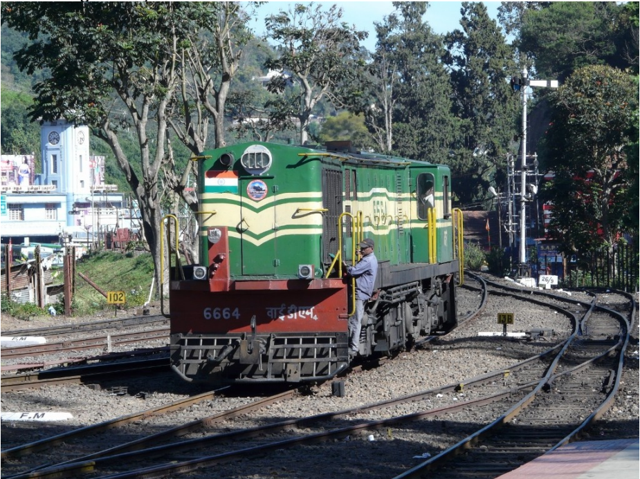
YDM-4 6664 in the yards at Coonoor having arrived from Ooty. P Watson

The approach to Coonoor was through a cutting which then opened out with the loco sheds on one side and the station on the other. Here was the sub-Continent's version of Dorchester South as we slowly ran through a complex series of points and paused before reversing back into the station. Another YDM-4 was ticking over in the sidings opposite the station but the highlight was a Class X in steam and another visible outside the shed. Unfortunately, this was the end of our rail journey but not before we were able to watch the loco change ready for the descent of the Ghats.