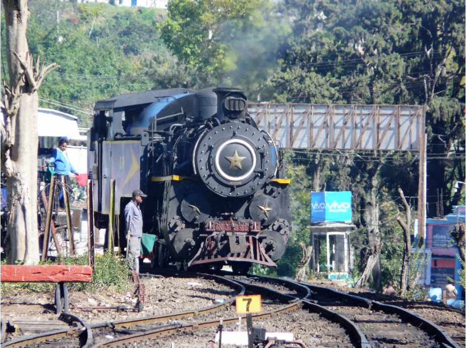
X Class 0-8-2T 37391 runs off shed at Coonoor ready to depart for the plains.

Back in 2013 we made our first ever journey to the sub-Continent during the course of which we managed to get to see the National Railway Museum in New Delhi. There were numerous exotic locos there ranging from a Bengal and Nagpur Garratt to more recent diesel and electrics. One that stood out for me was a rack loco that had worked in the Western Ghats on the line up to Ootacamund – or Ooty as it is known to visitors and locals alike. This was a Class X 0-8-2 tank engine built in 1923 by SLM Winterthur.