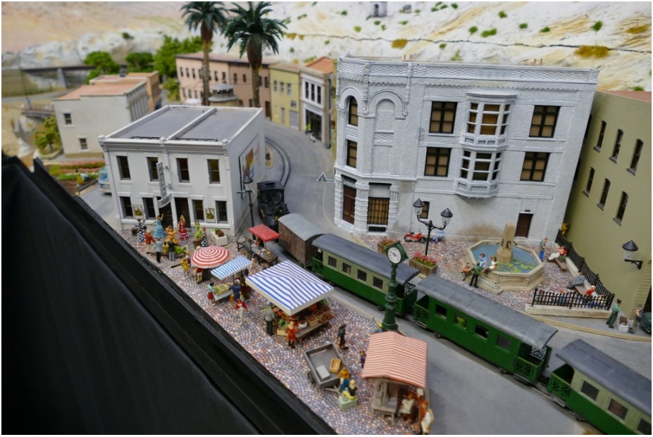
Ferrocarril San Maria Gandia which combines street running trains and working road vehicles sharing a tunnel.