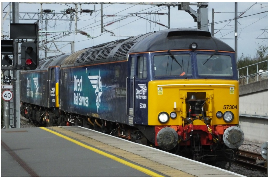
DRS class 57 loco 57304 heads south through Nuneaton on Tuesday 25 March 2019 with sister loco 57301 in tow. This working was to exchange 57304 for 57308 as the Rugby thunderbird loco. K Aveyard