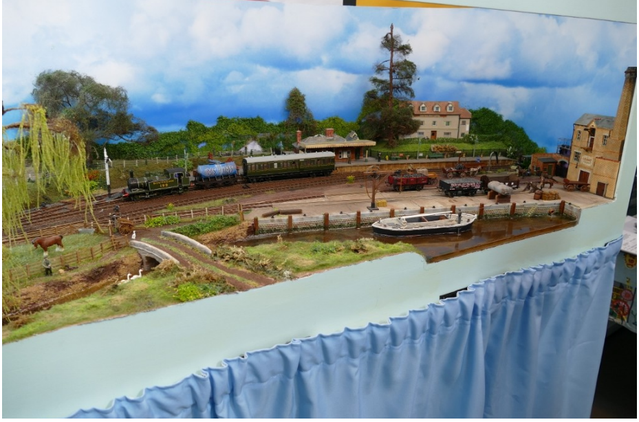
Exton Quay a magnificent representation of a country quayside station also featured highly in visitors reviews.