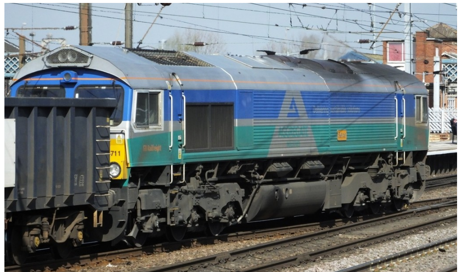
66711 Sence at Doncaster on 28 March 2019.

GBRf 66721 identified by it's London Transport livery was seen on the avoiding line on its way from London Gateway to Rotherham Masborough and in the opposite direction 66778 passed on a Stud Farm to Doncaster. In between 66105 had popped up on an extra Wakefield to Felixstowe liner and shortly afterwards 88001 ran through this tme on electric working a rather short length Millerhill engineers.