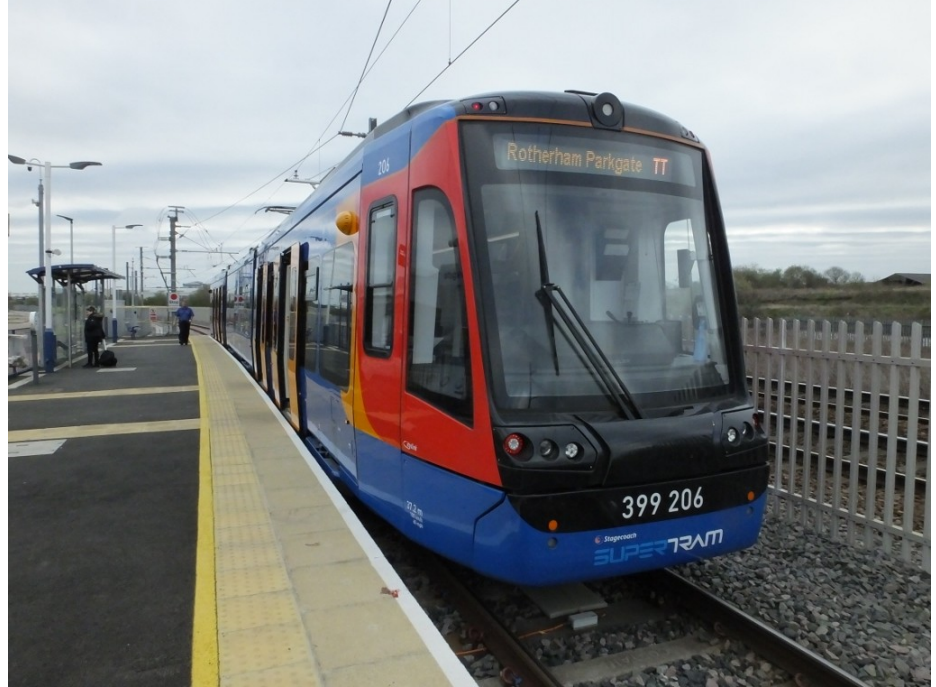
Tram train 339206 at Rotherham Parkgate on 26 March 2019. K Aveyard

Wednesday saw us head off to Sheffield where we hoped to clear off our last remaining tram, 399207 and also have a ride on the tram train service to Rotherham Parkgate. Another early start saw us parking at Meadowhall and catching a tram in to Sheffield centre where as luck would have it 399207 passed us just as we arrived at Ponds Forge at around 0820. Within a few minutes 399206 arrived on the tram train service and after reversal at Cathedral we boarded it for the run out to Parkgate, arriving just before 0900.