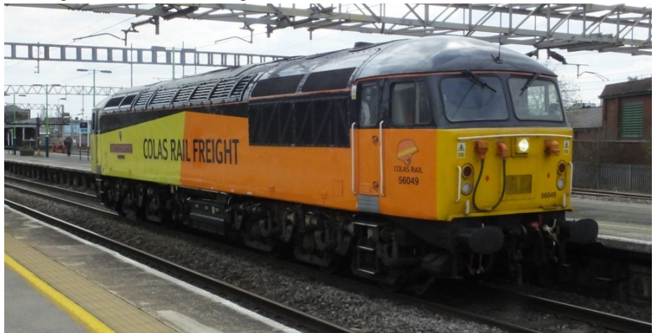
Colas 56049 Robin of Templecombe at Numeaton on 25 March 2019 KA

Arrival at Nuneaton was around 0940 and almost immediately 66176 raced through on a Dollands Moor – Ditton service. Most of the freight paths in realtime trains were Q paths and not running, including the Crewe – Mountsorrel which is usually a class 68, but over the course of the day 35 workings were seen including some ususual locomotive moves.