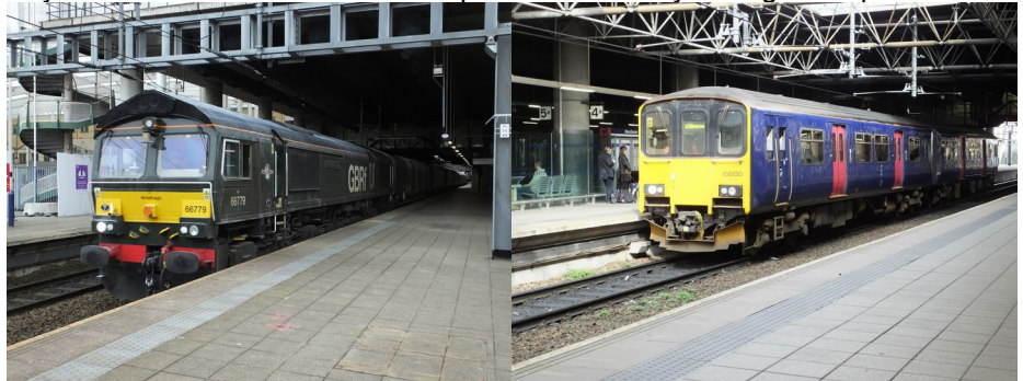
Green liveried 66779 and Great Western liveried 150130 at Manchester Victoria on 23 March 2019.

On Saturday I made my usual pilgrimage to Manchester for the Spring Transport Fair at the Boyle Street museum. Travel out from Bradford was on 153331 with a 155 unit attached behind. After a not very expensive day browsing the stalls I made my way back to Victoria for 1330 with the intention of photographing a selection of Northern rail units, and in particular trying to add to my class 142 pictures before they are all withdrawn. Victoria now sees regular Trans Pennine trains currently all class 185's but due to be replaced by the class 68 powered Mk5 push pull sets later this year. Northern units included classes 142 150/1 150/2 153 155 156 and 158 plus a solitary 319 unit, including some ex First Great Western 150/1 units still in plain blue livery. Loco hauled trains through Victoria are rare but there is a Saturday afternoon empty stone working from Salford and I was delighted to find 66779 as I had only ever seen it hidden under a tarpaulin on delivery through Newport.