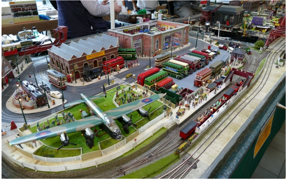
A close up of the Lancaster which from time to time spins the propellors with appropriate sound effects.