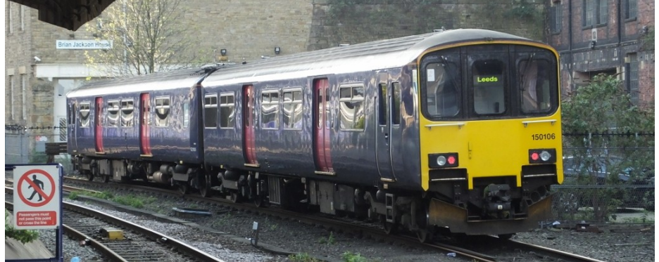
Ex Great Western unrefurbished 150106 stabled at Huddersfield

I decided to have a look at the bus station and return for the train an hour later and thus completed both links between Brighouse and the Calder Valley line.