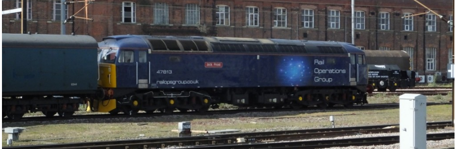
47813 arriving from Ely with HST trailers.

The Doncaster to North Blyth that had been 66755 on the previous Friday and also at York on Monday turned up with yes you've guessed it 66755, so it's not just the Southampton Gypsum working that keeps the same loco for days on end. One working that appeared interesting on paper was Ely Papworth Sidings to Wabtec which could only mean ex Great Western HST coaches coming for the power door modifications and indeed rail Operations Group 47813 with five trailers and two barrier wagons arrived just before 1300.