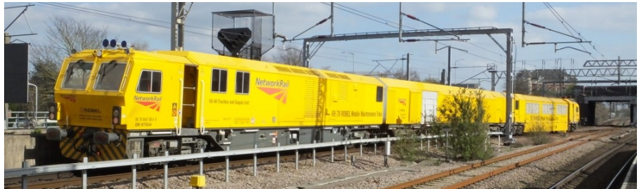
DR97804 and DR97504 en route from Retford to Rugby.

First up was 56049 now carrying the Robin of Templecombe name which crept in from the north and reversed on a round trip from Doncaster followed by a light engine move from Crewe to Rugby which saw DRS 57304 and 57301 heading south and an hour later 57301 returned with 57308 having presumably made a swop of the Rugby based west coast thunderbird loco. In total Freighliner gave us 20 locos including three pairs of 90's and two class 70's with the rest being 66's, the next largest operator being GBRf with 9 class 66's and 59003 on the Westbury to Stud Farm. The Colas working from Westbury to Bescot was 70807 making their loco count 2, whilst the DRS trio was matched by a trio of DBS 66's. There was another appearance of the Network Rail New Measurement Train with the same power cars from the day before and a couple of track machines working to and from Rugby.