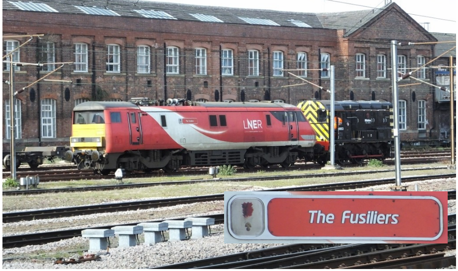
As a postscript to the Gresley's Gallopers series of articles, 91118 The Fusiliers is seen at Doncaster on 28 March 2019.