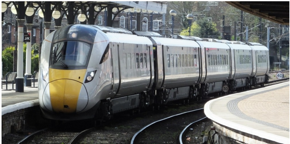
800201 arriving a York on 25 March 2019.

This was due in at 0953 and turned up as 68020 Reliance which parked up in platform 2 and despite there being more trips scheduled, it remained there for the rest of the day. Next up on Realtime Trains was a Heaton to Cambridge working which turned out to be the Network Rail New Measurement Train with 43013 and 43062. A light engine move from Scarborough to Longsight used to swop over the Scarborough based training loco was 68030 and shortly after an IEP training run saw white liveried 5 car 800201 arrive running on diesel power.