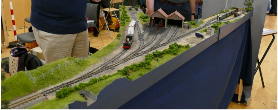
Lynmouth, Lynton and Barnstaple a modular 009 layout which magically changed shape overnight.