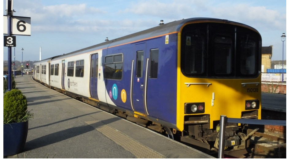
150138 waiting to leave Huddersfield for Leeds via Halifax and Bradford.

This journey was on newly refurbished 150138 which I had seen at Bradford that morning on the same service. The interior was very nicely done. This service also called at the new Low Moor station and it was interesting that a respectable number of people boarded there at what was 1731 on a Saturday teatime and it was obvious they were heading to Leeds for a night out.