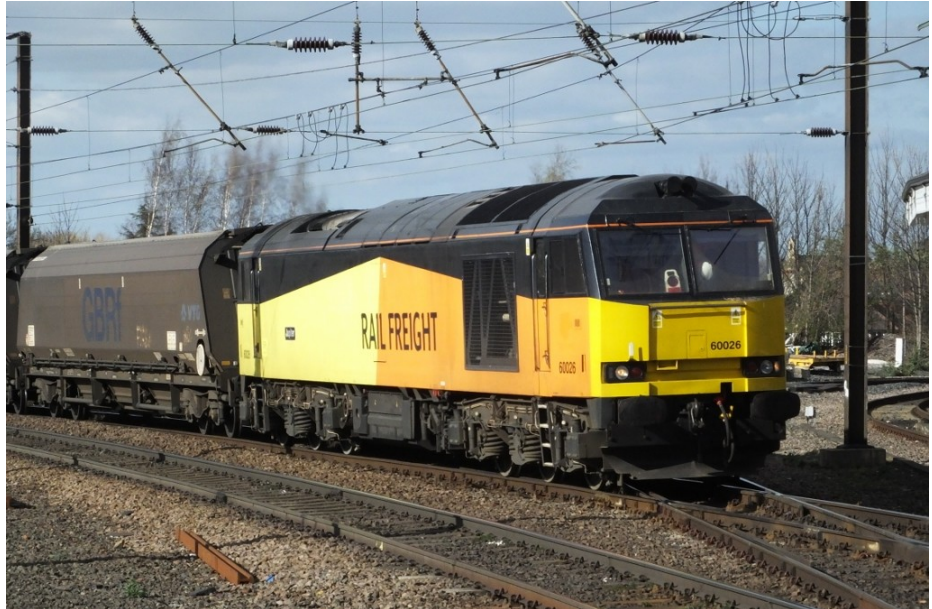
With the Colas part of the name removed GBRf operated 60026 passes York on a Tyne Dock to Drax Biomass train on 25 March 2019. KA