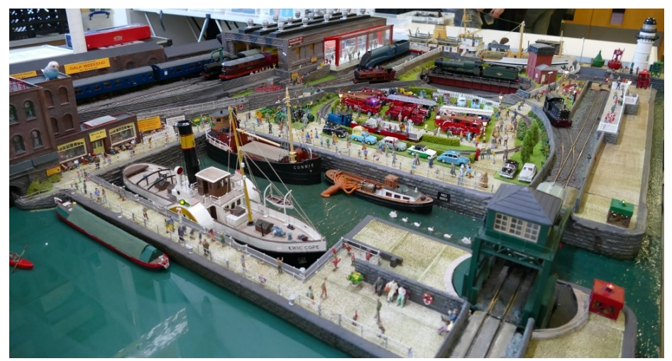
The dock area with the loco shed behind and in the foregroud the working lifting bridge. The ships on the layout are based on genuine examples with one cargo ship in memory of a mutual friend from way back who worked in the shipping industry and was involved in narrow gauge railway preservation and the West Yorkshire Transport Museum.