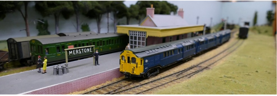
Merstone with both Southern steam era stock and ex London Underground 1923 units.