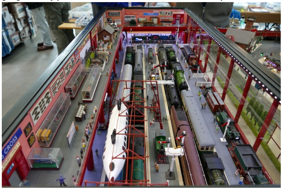
The railway hall with examples of the big four and the famous Bennie Railplane.