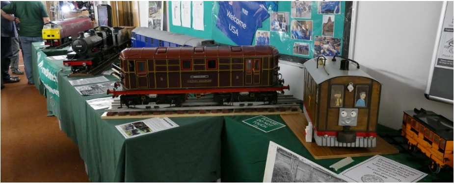
Large scale models from the Wimborne District Society of Model Engineers, including the ever popular Toby and an S and D 7F.