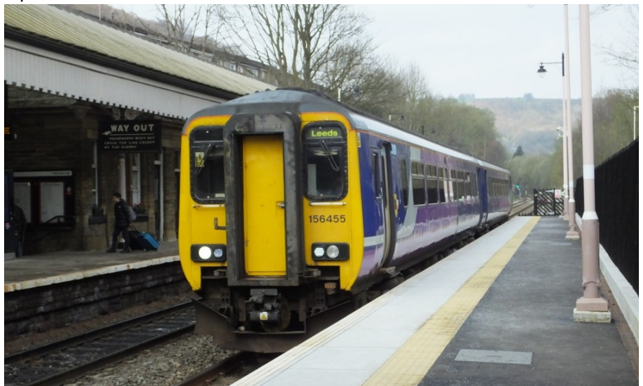
156455 runs in to Hebden Bridge alongside the new platform extension.

After a day off, I had a Saturday to fill so I decided to get a West Yorkshire Day Rover ticket and see if I could pick up a few Pacer pictures and maybe a ride before they begin to be withdrawn. I started with a run from Bradford Interchange to Hebden Bridge on board 153360 which had 153330 and 155341 in tow on the 0948 Manchester service. The 153's are also destined for withdrawal this year whereas the 155's have had the PRM modifications and will remain in service. Hebden Bridge has received platform extensions ready for the new DMU's and very sympathetically installed lifts complete with Lancashire and Yorkshire style signs. After a short wait I boarded 156455 for a trip via Brighouse and Mirfield to Leeds. Fortunately this train ran, many of the others on the Leeds to Southport service were cancelled as they're operated by Lancashire based crews where Saturdays are covered on overtime. This service was extremely busy and after leaving Dewsbury we were full and standing but we did manage to clear Batley and Morley passengers at a squeeze.