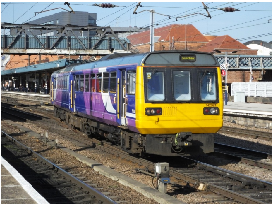
Northern rail liveried class 142 Pacer unit 142021 leaves Doncaster for Sheffield on 28 March 2019. Ken Aveyard