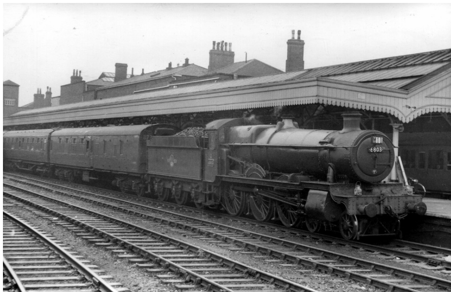
6803 Bucklebury Grange at Wolverhampton 14 July 1962 WRS C501