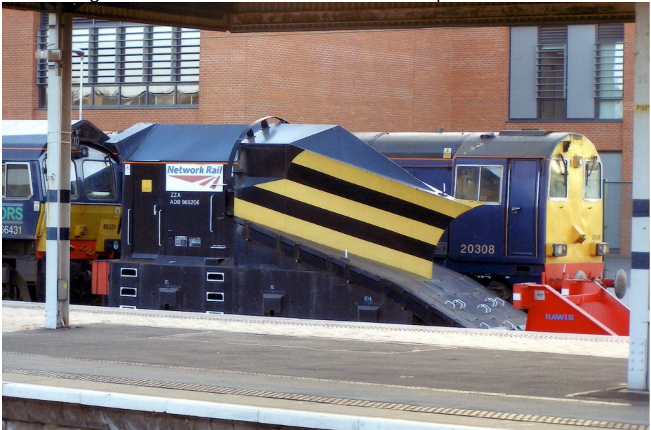
Front ¾ view of ADB965206 at York with some ancient and modern DRS locos, April 2014.

Bringing us up to date, the first six built ploughs are now all withdrawn, with two in preservation, the other four having been scrapped. Six of the production-built Cowlairs examples are still in service, as are six of the Eastleigh built versions. One from each works is preserved.