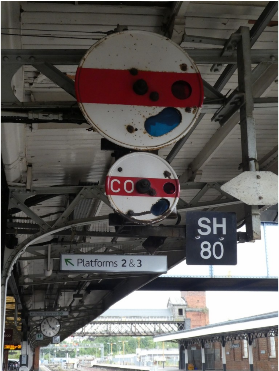
Unusual 'Banjo' signal at Worcester Shrub Hill. 3rd September 2019. PC

Whilst all the above can look ancient, and are often described as traditional GWR signals, most of the equipment seen will date from later British Railways (Western Region) era. Indeed older mechanical signalling often requires