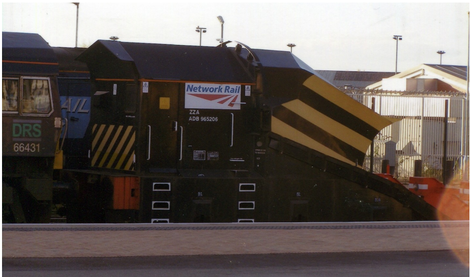
Rear ¾ view of ADB965206 stabled at York, April 2014. ZZA is the 'TOPS' code. See Steve Green's snowplough article from page 4. Steve Green