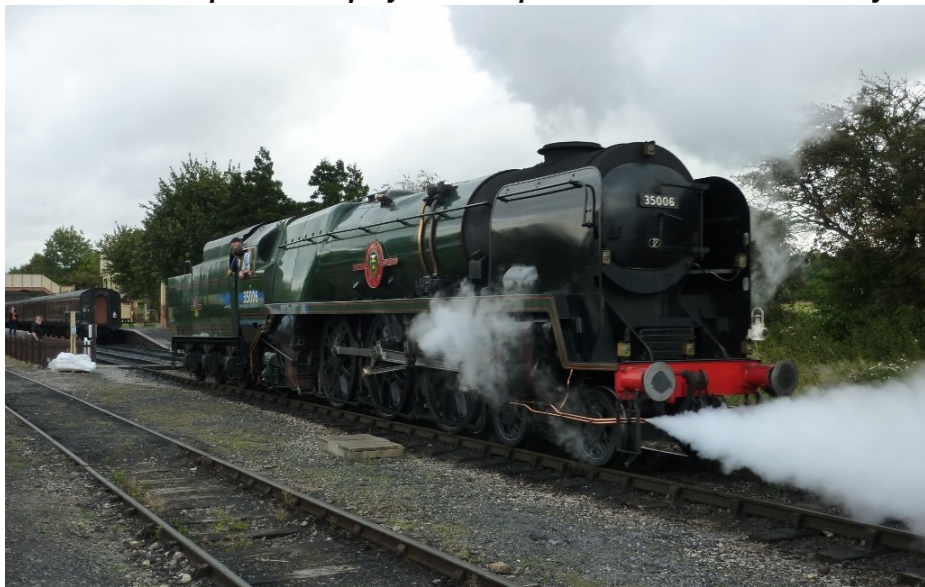
35006 Peninsular and Orient S N Co at Toddington on the Gloucester and Warwickshire Railway on 11 September 2019. Colin Aveyard