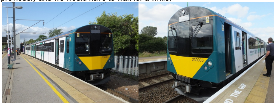
230005 at Bedford station and again at Ridgmont on the delayed trip.