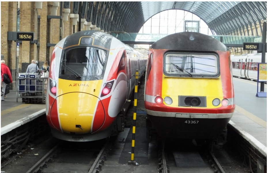
The front cover of Corkscrew 110 showed an Azuma next to a Pacer so on the rear of Corkscrew 113 we see Azuma 800110 alongside soon to be replaced HST power car 43367 at Kings Cross on 19 August 2019. KA