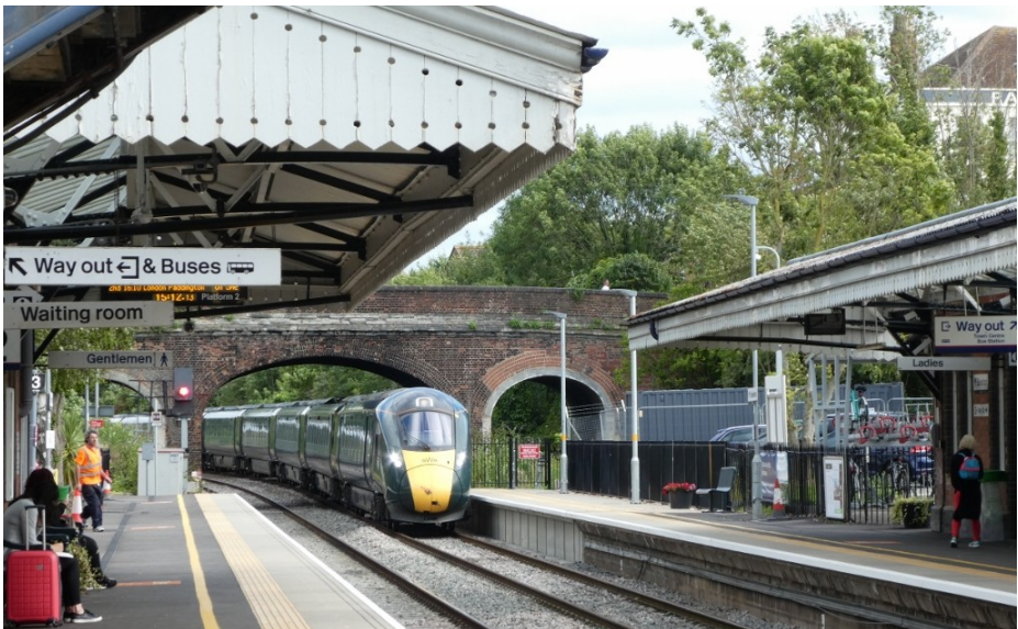
The 15.22 London Paddington - Worcester Shrub Hill arrives at Evesham with 800303. 4th September 2019.

It was obvious I'd turned up at a bad time as nothing was shown on the screens arriving for about 50 minutes. Long ago one might have hoped for a non-passenger movement to alleviate boredom, but rightly I was proved correct in seeing nothing before the timetabled services which I decided to hang around for. First to appear at 15.13 was GWR IET bi-mode 800303 with the 13.22 Paddington – Worcester Shrub Hill (due at Shrub Hill 15.27).