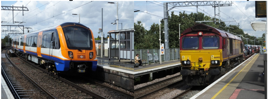
710267 at Wanstead Park and 66003 passing Haringey Green Lanes. KA

From Haringey Green Lanes we followed another walking route to Haringey on the GN inner suburban lines from where we caught a train up to Hornsey looking for new 717 units. Word of advice – that walk is uphill and better done the other way!! There were some 313 units still in use, they would continue until their final day on 30 September but we managed to see 12 of the new units. From Hornsey we went to St Pancras using the new Canal Tunnel before doubling back to Hendon passing Cricklewood depot.