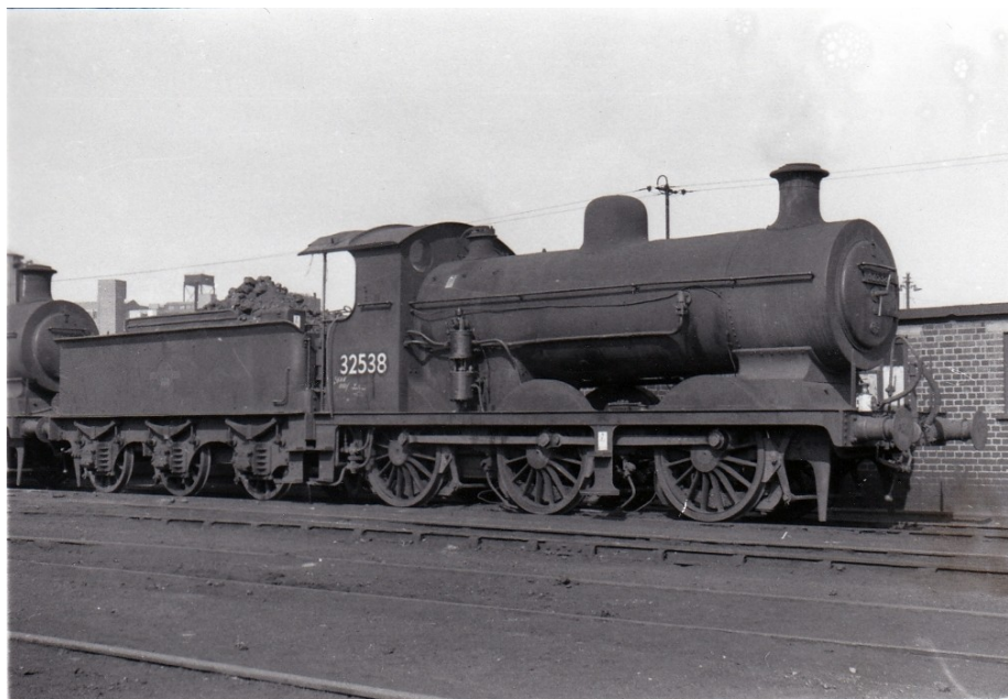
Southern Billington class C2X 0-6-0 32538 of 1908 at 73B Bricklayers Arms 18 September 1960.