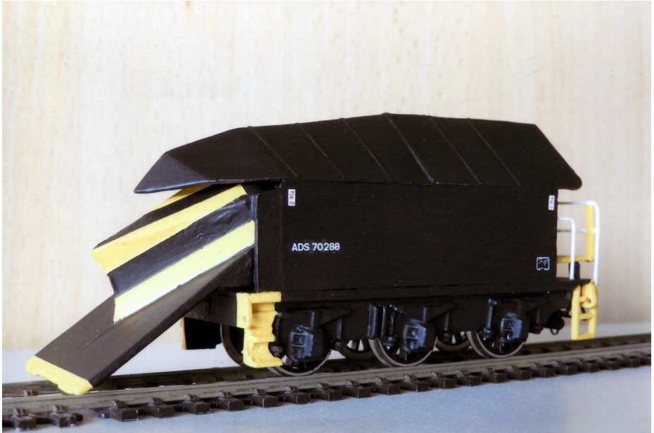
Genesis Kits SP1, one of the former 'Schools' class tenders as rebuilt into a snowplough. Carries the fictitious no. ADS70288.

Also surviving are two unidentified tender mounted ploughs, possibly from the third batch described above. One is of ex-GCR origin, stored at the Midland Railway – Butterley and the other one is of ex-LNER origin, formerly stored at the North Norfolk Railway, but its whereabouts are now unknown.