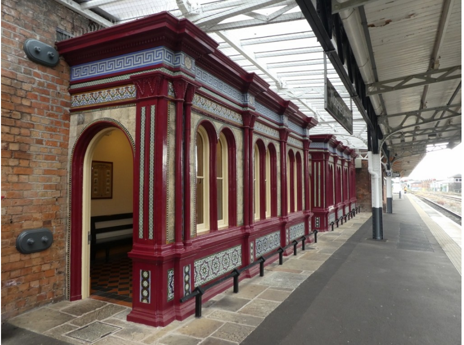
Victorian waiting room. Worcester Shrub Hill. 3rd September 2019.