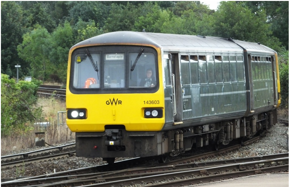
Great Western liveried class 143 Pacer unit 143603 descends the bank from Exeter Central in to Exeter St Davids on 14 August 2019. K Aveyard