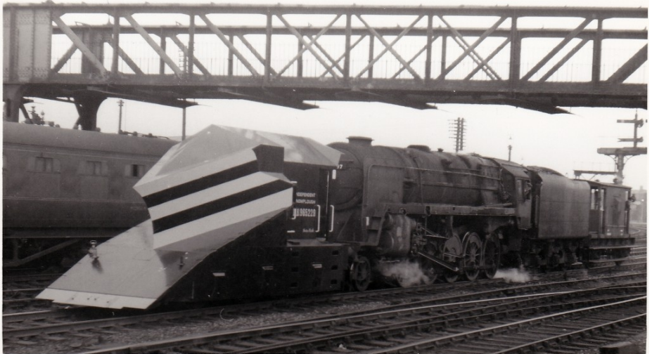
92197 propelling snowplough DB965229 Derby 22 May 1965. WRSC1133