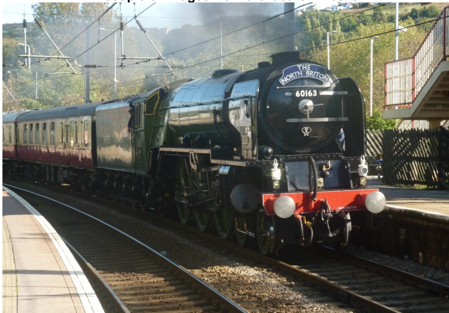
60163 Tornado passes Shipley on 28 September 2019. Colin Aveyard

A couple of images from the last few weeks.