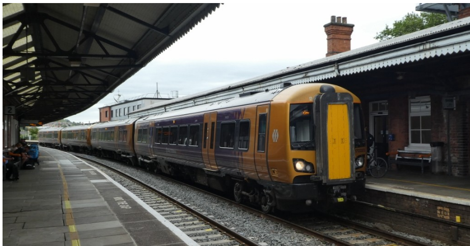
172220 + 172218 arrive at Worcester Foregate Street with the 13.19 Whitlocks End - Great Malvern on 3rd September 2019.

As it happens I was just five minutes' walk from Foregate Street station, so I shortly found Foregate Street which is also the A38. The ornate bridge of 1906 which was refurbished by Network Rail in 2010 crosses the street at the west end of the station. In fact the station platforms are on top of a viaduct, though not so obvious at street level as it's hemmed in by buildings. I climbed the stairs from the booking office area to platform level to see what was about.