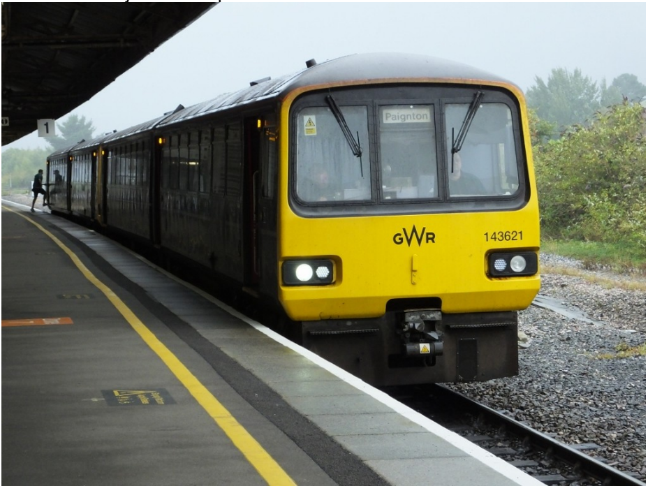
143621 at Newton Abbot on a Paignton service on 14 August 2019. KA

A few days later my son Robert and I decided on a day out in Plymouth, mainly to photograph buses, but also tying in with an opportunity for me to try and photograph the last two GWR pacer units based at Exeter that had so far evaded my camera. We drove to Axminster for the 0902 to Exeter where we transferred to a Cross Country Voyager for the run down through Dawlish to Totnes and Plymouth. This is always a nice ride with the views out to sea. On arrival at Newton Abbot there is a cross platform connection to the Paignton stopper which leaves Exeter just before the arrival of the train from Axminster, a handy tip to know instead of waiting at Exeter for a later train. Anyway one of the two class 143's on this service was required 143621, and much to Roberts consternation I hopped off the Voyager ran across the platform, got the shot and rejoined the queue to board.