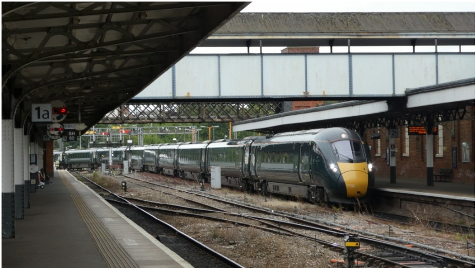
Worcester Shrub Hill. 800306 arriving on the 15.14 Hereford - London Paddington. 3rd September 2019. Paul Carpenter

Some notable signals are still to be found at Shrub Hill. It has been said that Worcester has missed out in the past as a priority for re-signalling because despite being on several distinct routes, it's the wrong end of them! The signalling and track layout is much rationalised from former times, nevertheless it is still approaching the third decade of the 21 st century a bastion of traditional signalling practice.