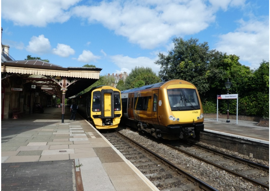
The clock at Great Malvern is wrong and both trains are on time! 170635 departs on the 13.50 Birmingham New Street - Hereford whilst 158959 is waiting to leave with the 14.50 to Weymouth. 5th September 2019. See article by Paul Carpenter from page 10.