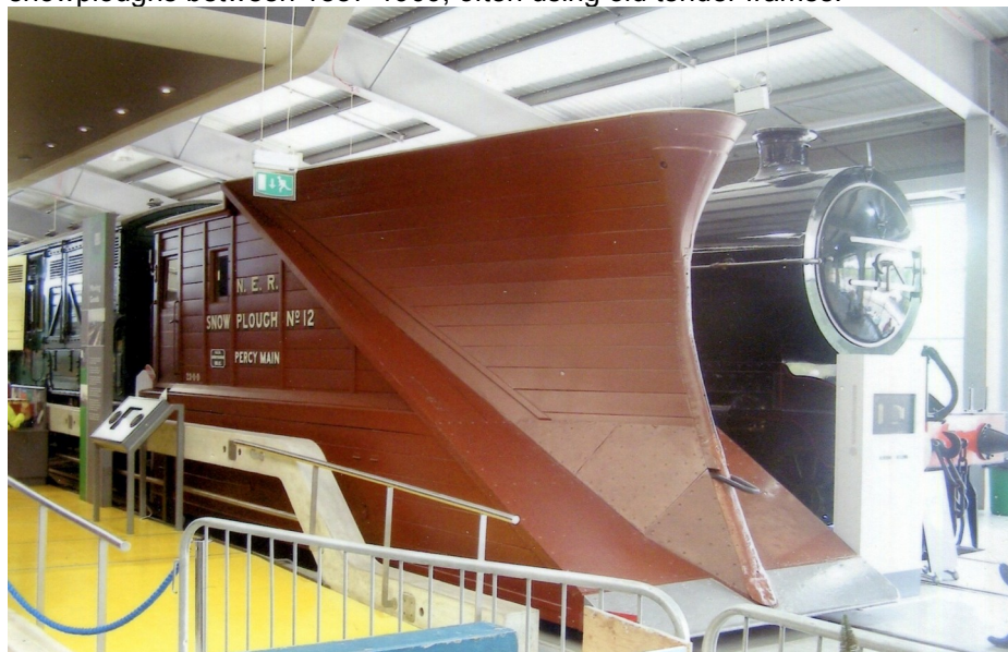
N.E.R. snowplough No.12, allocated to Percy Main, on display at the NRM Shildon, August 2016.

This phenomenon wasn't new however, as the NER built 24 large, wooden snowploughs between 1887-1909, often using old tender frames.