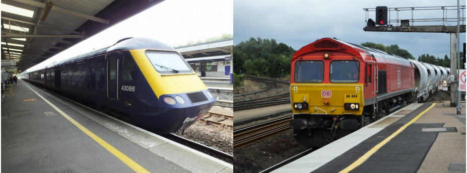
43086 at Plymouth on one of the GWR short sets, and 66044 brings one portion of the china clay train for Riverside yard. Ken Aveyard

Back at Exeter it was apparent that the cascade of more modern DMU's was beginning to show with quite a number of two car class 158's reformed from the three car versions in service, together with 150/2 which have displaced the 153's to Cardiff. The last eight 143's generally work in pairs on the Exmouth to Barnstaple and Paignton services, but soon the Barnstaple service will be self contained with 158's, the 143's will be withdrawn and the two remaining three car 150 units, 150001/2 will finally transfer to Northern.