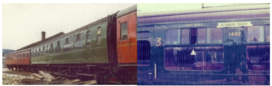
1469 at Oxenhope in 1978 and, right, window detail of 1482 at Horsted Keynes in 1976

1464, 1481 and 1482 have all seen extensive use on the Bluebell Railway, where 1464 and 1482 are in regular service having received recent overhauls; at present 1481 is awaiting a further overhaul. 1464 was purchased on withdrawal in November 1968 by the Southern Coaching Group for use with Clan Line prior to arriving at the Bluebell, 1481 was purchased by the Bluebell in 1970. Three years later, 1482 went to the Bluebell having been exiled to the Scottish Region as a 'swapsie' for Mk1s for the Bournemouth scheme in the same way that 1469 went to the ER.