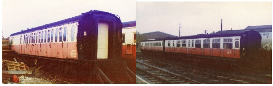
'Shorty'BTK 2850 showing its multi-door configuration in contrast to the more common BTK 4036 (right) carrying Chipmans No. CWT12, both photographed at Chipman's depot, Horsham September 1976. Behind 4036 is a Maunsell BCK, either 6697 or 6699, both now stored on the Swanage Railway.