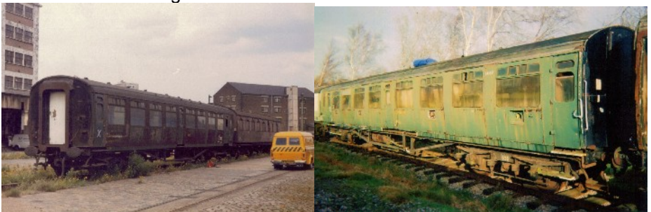
1456 at South Lambeth goods depot in May 1980 and, right, 1457 stored at 'Cripple Creek' prior to being sheeted over in 2003.

The first two coaches, 1456 and 1457 are from the 6 car Bournemouth Restaurant sets, coming from sets 295 and 296 respectively, and both retain the extended bodyside sheeting. They were 64 seat coaches arranged in two saloons with two toilets at one end, the arrangement that was copied exactly in the Mk1 TSO design.