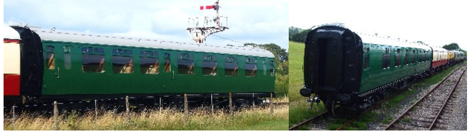
Both sides of newly out-shopped 5761 at Harmans Cross in August 2010

Restoration completed, the coach was placed into traffic during 1986 and frequently ran with BTK 4365. Withdrawn for attention in the early 1990s, it was placed in a siding while the Swanage Railway built up its fleet of Mk1s coaches. Sadly, the condition of the coach seriously deteriorated but there were no resources available to return it to traffic. Subsequently, the coach changed hands and is now owned by the author, who is also the Project Manager for its current restoration.