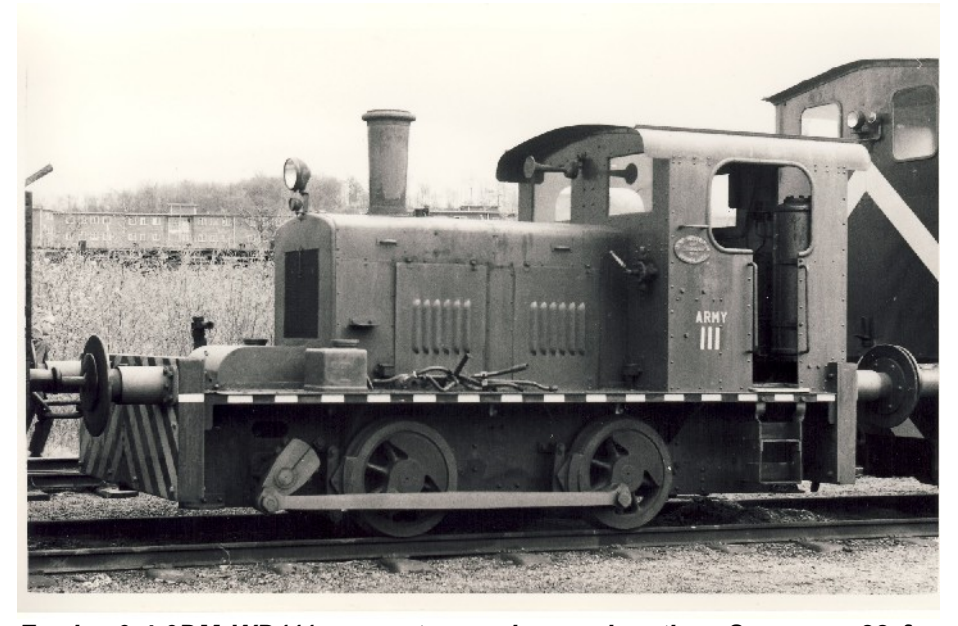
Fowler 0-4-0DM WD111 seen at an unknown location. See page 22 for more information on this loco and its connection with Marchwood.