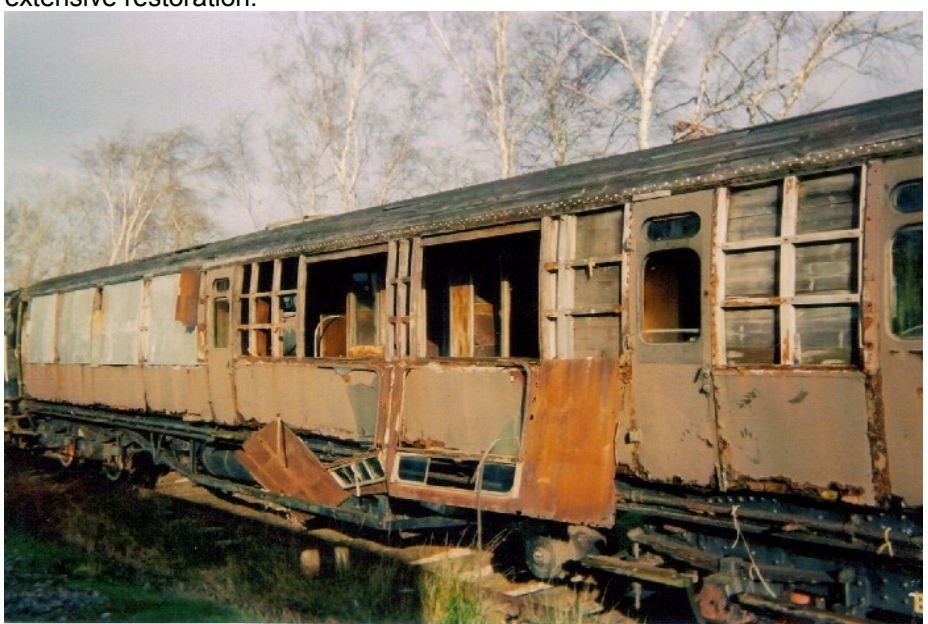
4366 stored at 'Cripple Creek' near Norden, prior to its move to its present off-site store, where it is at least (and at last) protected from the weather. This is what happens to a coach when left unprotected for 25 years. However, one can at least see some of the construction details!

converted for use as an Inspection Saloon by having the brake-end corridor connection removed and windows inserted in that end of the coach. It was purchased from Long Marston for the Watercress line in 1992. Subjected to vandalism while in store at Alton, the coach is currently undergoing an extensive restoration.