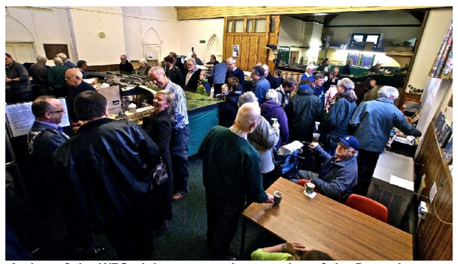
A view of the WRS clubrooms on the occasion of the December open day showing visitors enjoying the layouts, browsing the sales table, and having a cup of tea.