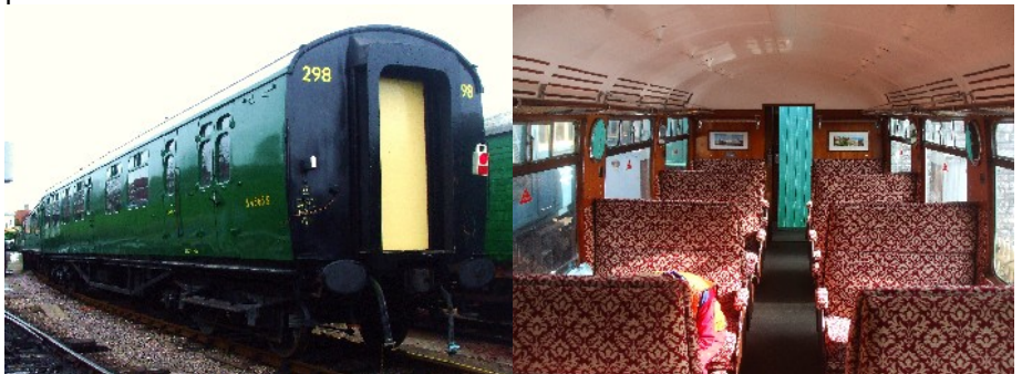
Pictured at Swanage in 2010, 4365's exterior and saloon interior are seen; in the latter the orange 'shape' is one of the volunteer team applying some finishing touches!

It underwent a major structural overhaul at Rampart of Derby and since its return to Dorset in 2007 has had extensive work carried out by volunteers at Swanage. This has included renewal of the floor in the saloon and complete fitting out of the interior. While the floor was removed the underframe members that could not previously be accessed were grit-blasted and painted. The brake system has been overhauled and new steam heating pipes installed. The ceilings were replaced in plywood instead of the old hardboard and a special jig was built to curve the panels to the correct profile. Throughout the seats cushions, backs and armrests have been renewed and recovered. All the veneers have been replaced, new reproduction pictures and maps acquired and the luggage racks refurbished with new netting. It is planned to commission the coach into traffic in March 2011.