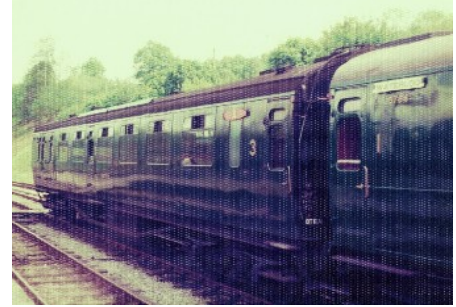
4211 photographed at Alresford May 1977, when it had been cosmetically restored. The smaller window to the coupe and that to the toilet at the far end will be noted. 4279, right, has the full compartment and was photographed at Horsted Keynes in 1976.