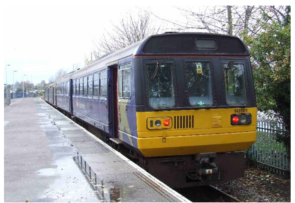
First Great Western class 142 unit 142001 still wearing North Western livery rests at Exmouth station on 9 November 2010. Ken Aveyard