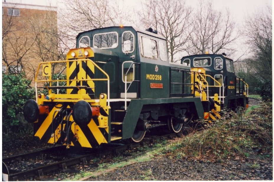
Thomas Hill "Vanguards" MOD 258 MULBERRY and MOD 263 McMULLEN made an appearance for the visit of "The Branchliner" railtour on Saturday 8th March 2003.