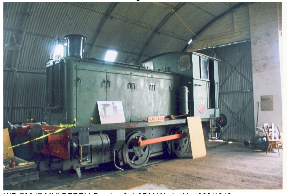
WD 70047 MULBERRY, Barclay 0-4-0DM Works No. 362/1942. This loco arrived at Marchwood as WD no.827, 8/2/60 and was named 6/62. She departed on 29/6/65. The photo shows her on display at the Long Marston Open Day on Saturday 7<sup>th</sup> June 2008.

Loco now preserved in working order on the Isle of Wight Steam Railway, arriving there during February 2005. Ownership handed over to the IoWSR from the MoD during 2008.