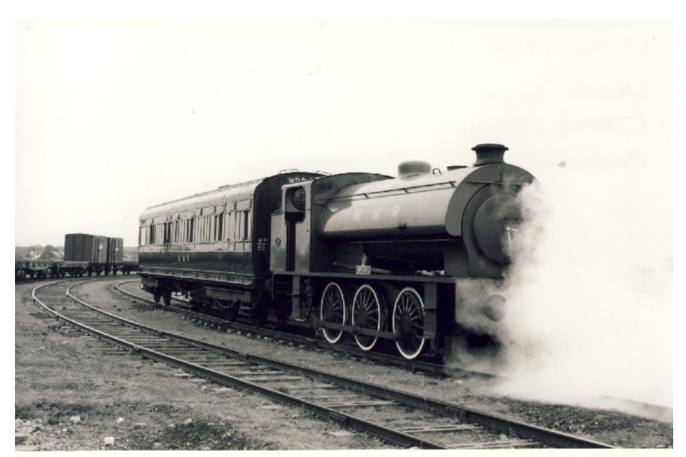
M M R lettered 0-6-0ST no. WD106 SPYCK and one coach at Marchwood, 17/5/58.